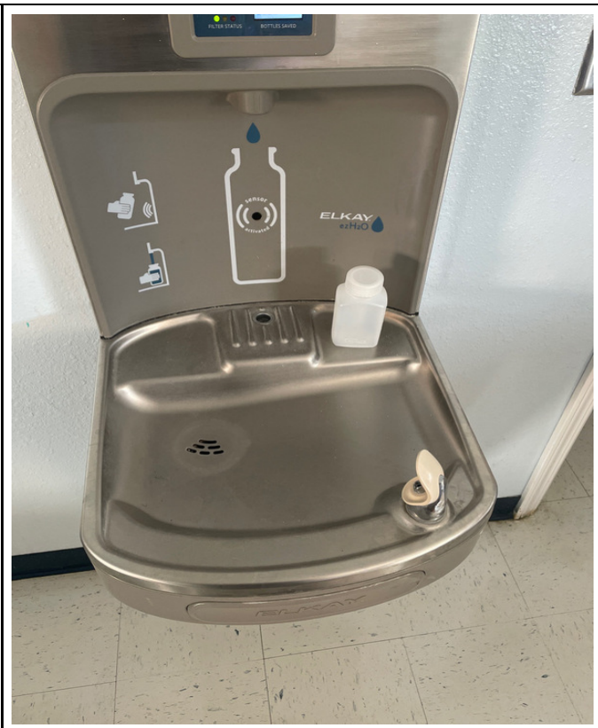
100-2 - Preschool - North Wall