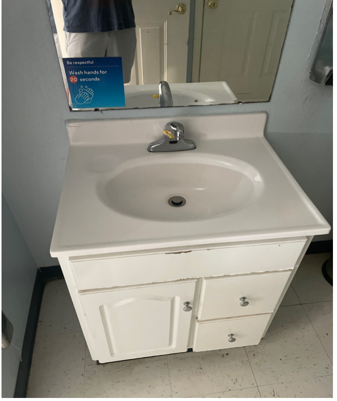
100-4 - Preschool - Bathroom