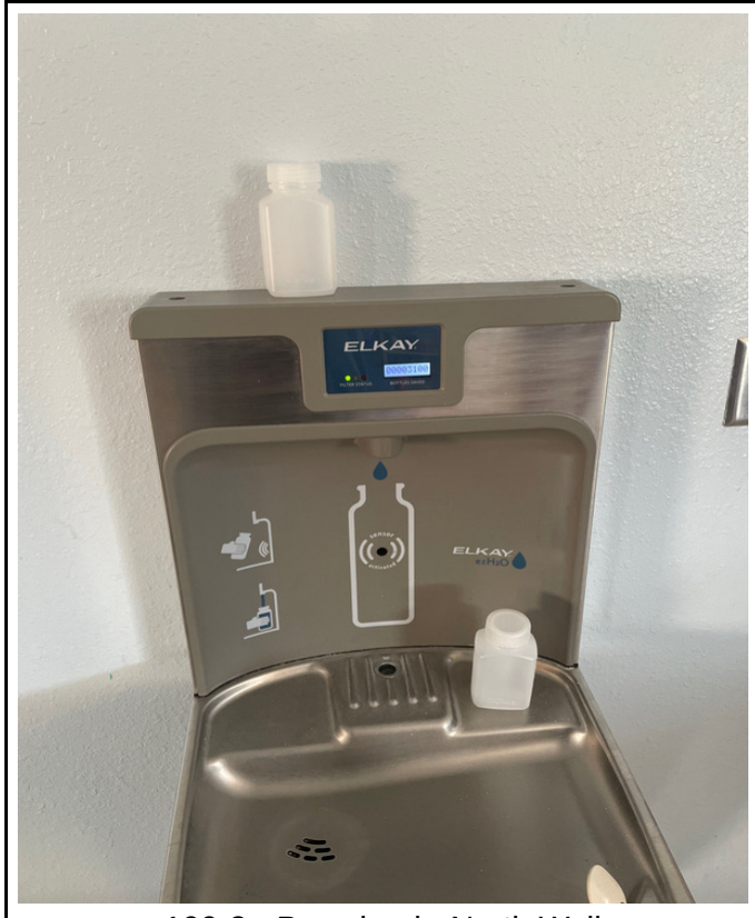
100-3 - Preschool - North Wall